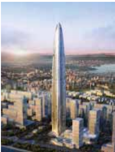
The 606m Wuhan Greenland Centre.

By 2020 China will have the largest share of buildings over 600m, according to the Council on Tall Buildings and Urban Habitat (CTBUH).