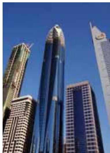
Citigroup noted a decline in activity.

Saudi has $648bn worth of projects in the pipeline, the report said, which represents a 90% increase on 2010.