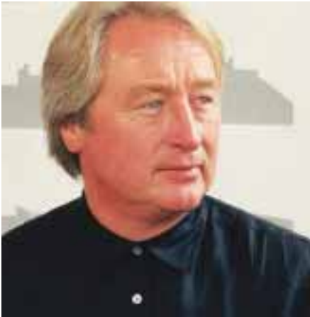
Holl is behind a major Beirut scheme.