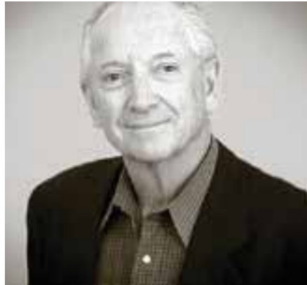
Graves has worked in Egypt and Lebanon.

In 2003, an infection of unknown origin left Graves paralysed from the waist down. He is still actively working in his practice, Michael Graves & Associates.